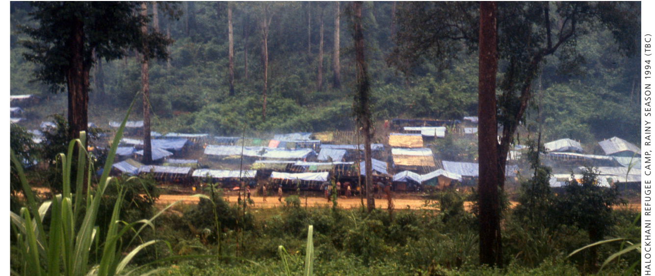
HALOCKHANE REFUGEE CAMP, RAINY SEASON 1994 (TBC)

The Military Intelligence chief, Gen. Khin Nyunt (also General Secretary-1 of the later State Peace and Development Council), travelled to Ye and invited the NMSP to start talks about a ceasefire agreement in late 1993. The NMSP then sent delegates to talk to military and intelligence leaders in the Southeast Command in Mawlamyine, capital of Mon State, for three