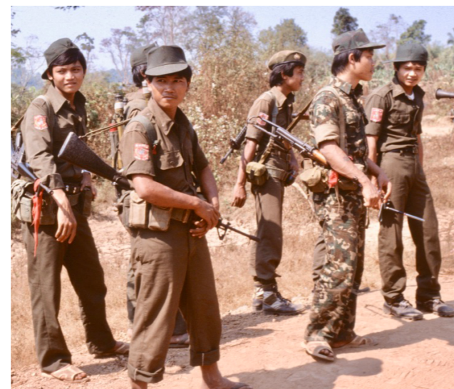
NMSP TROOPS ON THE ROAD TO THANBUZAYAT 1989 (M5)