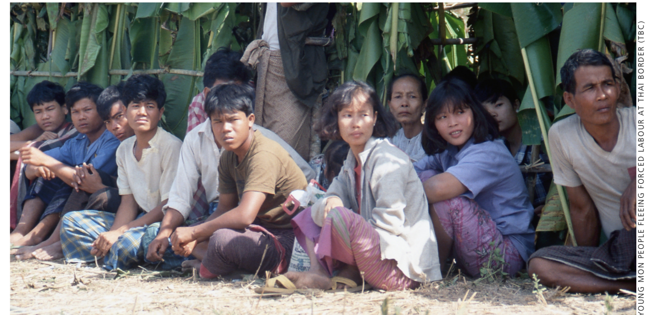
YOUNG MON PEOPLE FLEEING FORCED LABOUR AT THAI BORDER (TBC)

This pattern changed with the 1995 ceasefire. The agreement re-grouped all MNLA troops into 14 designated locations that are