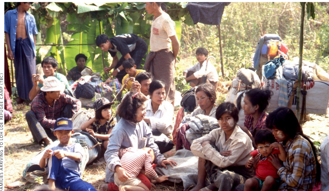
FAMILIES ARRIVING TO LOH LOE REFUGEE CAMP (TBC)