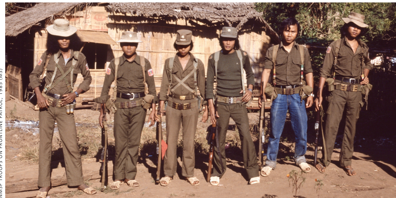
NMSP TROOPS ON FRONTLINE PATROL, 1985 (MS)

mostly in Mon State, with the remaining six locations – designated as temporary – in the Tenasserim Division far to the south of the NMSP general headquarters in Ye township. The Tatmadaw then planned to take over areas in Ye township and other territories where the NMSP was formerly active. Ye township is very large, and it has rich resources, including rice fields, rubber plantations, betel-nut plantations and many other kinds of fruit farming.