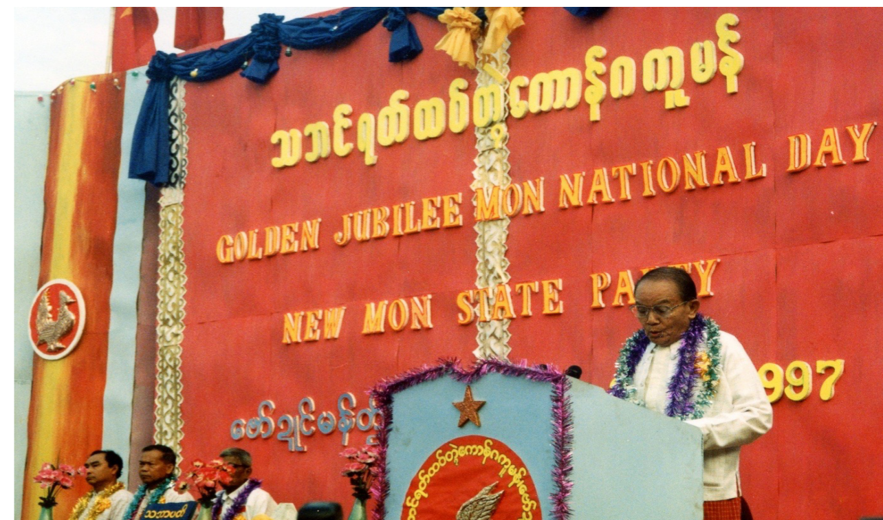
NMSP CELEBRATES GOLDEN JUBILEE MON NATIONAL DAY, 1997 (NA)

Following these splits, NMSP leaders faced the dilemma whether to attack the breakaway soldiers or tolerate different opinions. In both cases, Mon leaders reached a consensus that troops on the different sides should maintain a distance from each other in operations and use a policy of "watch and act" in dealing with internal conflict. The reality is that, since the 1995 ceasefire, large battalions of the Burmese Army have been established in Mon towns and villages in Ye township where the NMSP has been unable to reduce the government's military build-up on the ground.