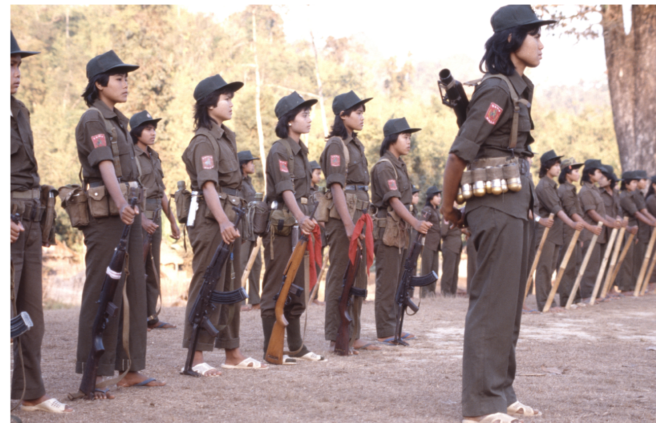
NMSP WOMEN SOLDIERS AT THREE PAGODAS PASS, PRE-CEASEFIRE (MS)