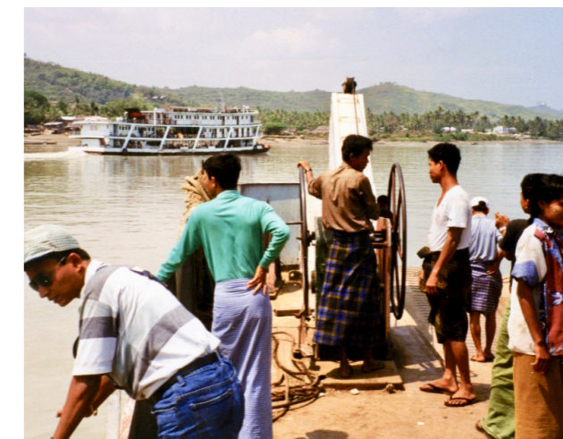
MAWLAMYINE TO MARTABAN FERRY BEFORE CONSTRUCTION OF THANLWIN BRIDGE (MS)

demands in the fields of human rights and politics (“the anti-politics machine” 58 ).