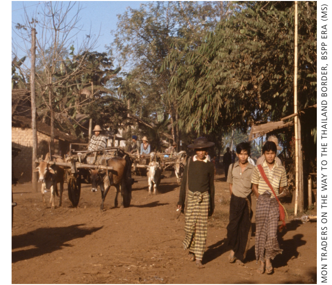
MON TRADERS ON THE WAY TO THE THAILAND BORDER, BSPP ERA (MS)

As fighting continued, the steps towards federalism took place during a process of negotiations with different opposition groups during the 1970s. By 1969, the NDUF alliance with the CPB was essentially defunct. With its failure, the NMSP joined with two new united fronts that led to the party's adoption of an explicitly federal line. The first was a short-lived National United Liberation Front (NULF: 1970-74) that included the KNU, Chin Democracy Party and Parliamentary Democracy Party of the deposed prime minister U Nu. 14 In a remarkable shift in alignments, U Nu took up arms alongside his erstwhile opponents in the Thailand borders in the late 1960s following his release from detention. With U Nu always ambivalent on the question of ethnic rights, the NULF did not prove a success.