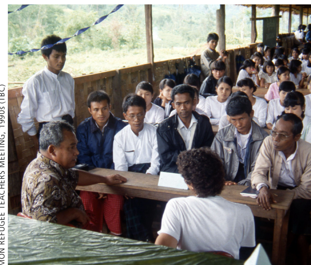
MON REFUGEE TEACHERS MEETING, 1990s (TBC)